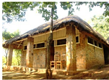
Above: Our house at language school