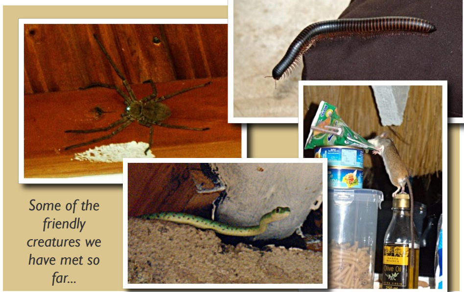
Some of the friendly creatures we have met so far...

One exciting milestone in the project will hopefully be at the end of March, when speakers of some of the languages of the region will come together for the first linguistic workshop , where they will be collecting hundreds of words from their languages which can then be analyzed linguistically to come up with suitable alphabets and writing systems.