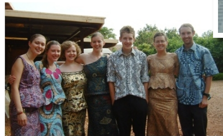
Spending time with the translation teams in Diebouougou and Tougan