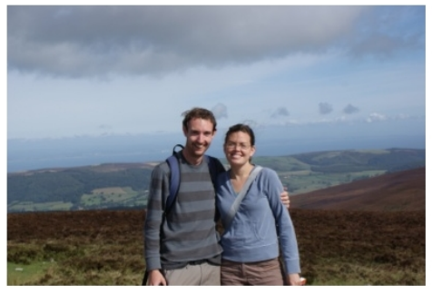
Some photos from a beautiful late September holiday on the Somerset coast